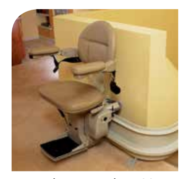
Top or bottom park position extends rail away from the staircase.