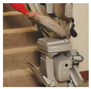
Power folding footrest automatically flips up/down when seat is raised/lowered.